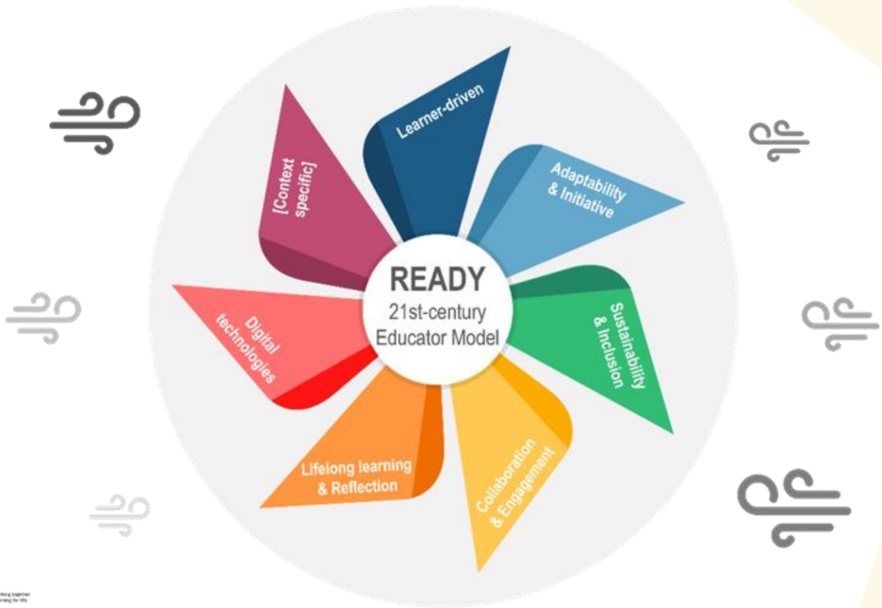
The READY Model